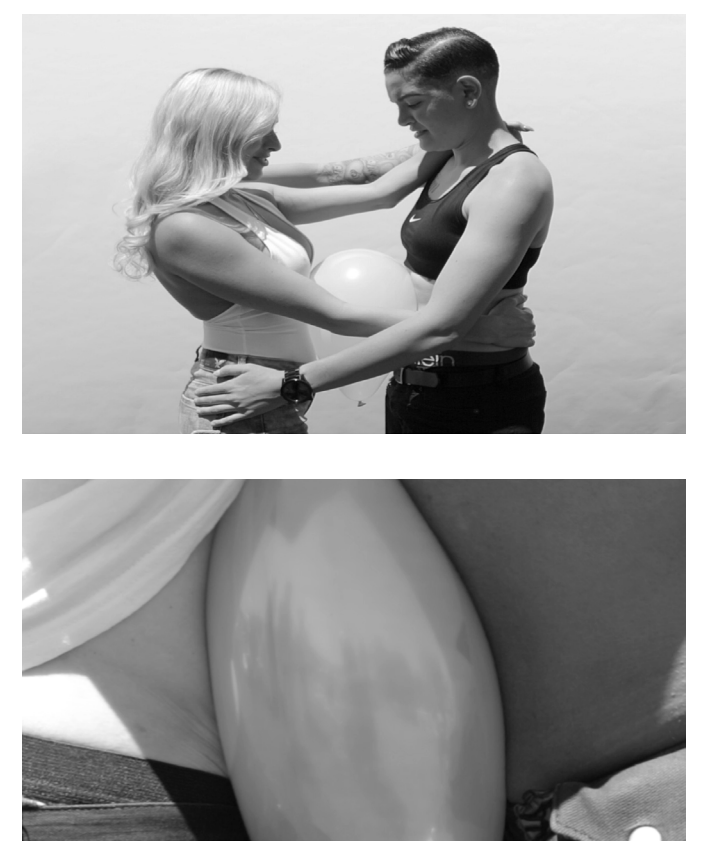
Top & Bottom: Cassils, 103 Shots (2016), 1-channel video work with sound, 2:35, film stills courtesy of the artist.

Indeed, Kissing Doesn't Kill: Greed and Indifference Do, and intimacy amongst strangers might be one of our most precious and radical strategies, still. Fear of the un-normal can be a source of power,<sup>2</sup> and Cassils' 103 Shots demonstrates what strength is possible when derived from the rejection of silence, of refusing gunshots and ancestors alike to remain static ghosts of our past.