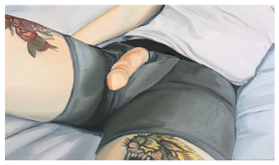
Sam Moyer Kardos, Big Packer Energy , 2020, Oil on Canvas, 12" x 8", Image courtesy of the Artist.