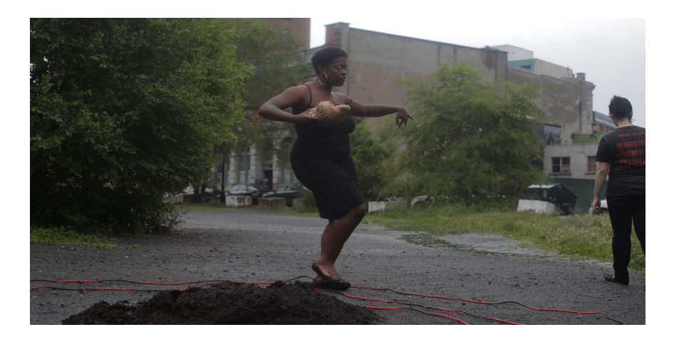
Gabrielle Civil, Fugue (Da Montréal) (2014), filmed performance with sound, 13:14, performance stills courtesy of the artist and Starr Rien.