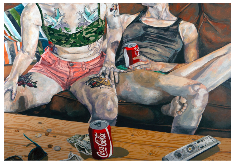
Sam Moyer Kardos, Untitled (Coca-Cola), 2014, Acrylic on Canvas, 60" x 48", Image courtesy of the Artist.