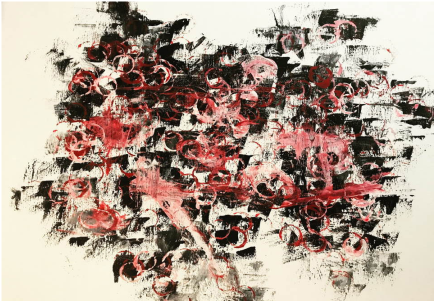
Abhipsa Chakraborty, Maps , 2020 , Acrylic on Canvas, 18" x 20", Courtesy of the Artist.

Chakraborty's work endeavors to undermine dominant culture's ability to define and police meaning, and to expose the invented narratives of those institutional powers. This is the heart of her objective: reject the "naturalized" and "self-evident"; open oneself to new pathways and possibilities; and reveal new ways of making and reading "maps."