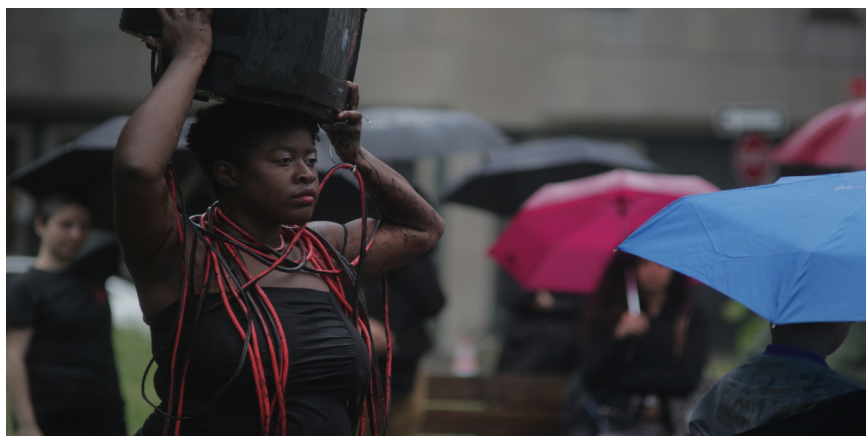
Gabrielle Civil, still from Fugue (Da Montréal) (2014), Image courtesy of the artist and Starr Rien.