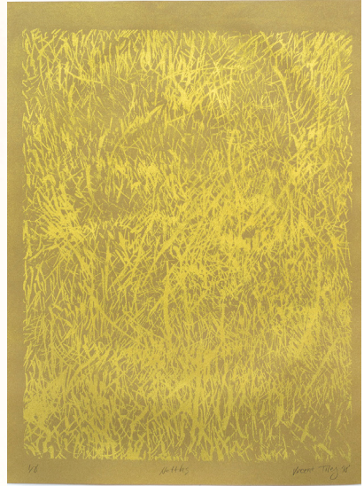
R: Vincent Tiley, Nettles , 2018 Edition of 8, 2 AP Silkscreen on paper with gold flocking 19" x 12.5"