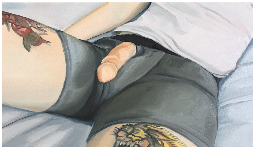
Sam Moyer Kardos, Big Packer Energy , 2020, Oil on Canvas, 12" x 8", Courtesy of the Artist.