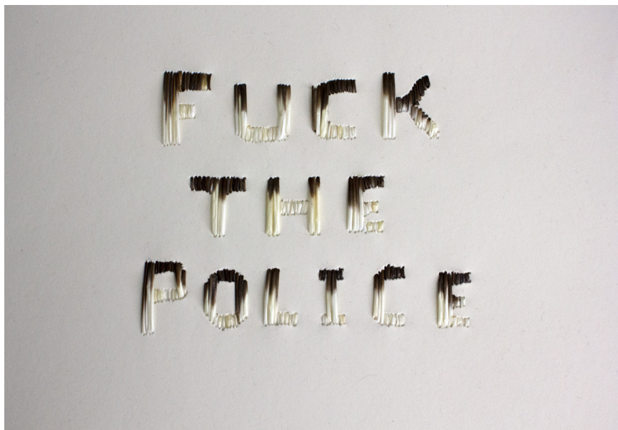
Julia Rose Sutherland, RIP, Rodney Levi (Which Reads 'FUCK THE POLICE') , 2020, Part 1 of 3-Part Series, Gawiei/Porcupine quillwork (embroidery) on paper, 9" x 12" (12" x 16" framed), Courtesy of the Artist.